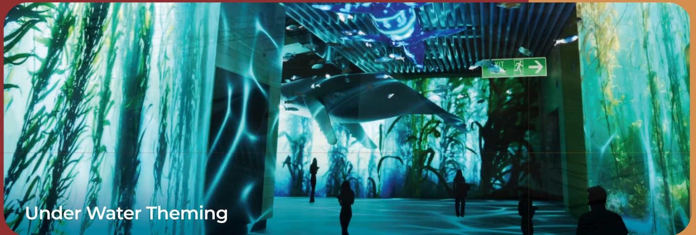
Under Water Theming