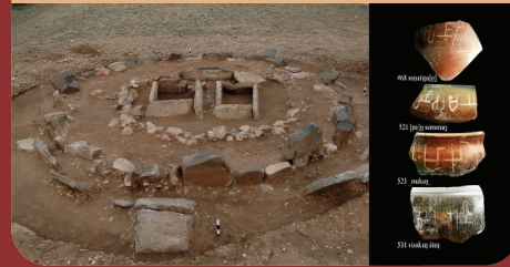
Post-Harappan Trajectories: The Impact of Climate Change