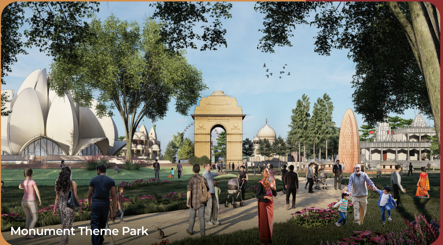
Monument Theme Park