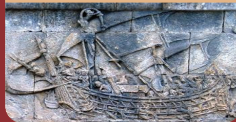
Trade and cultural relations with southeast Asia and beyond