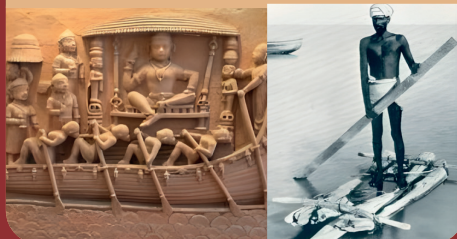
Traditional Shipbuilding and Navigation Techniques of India