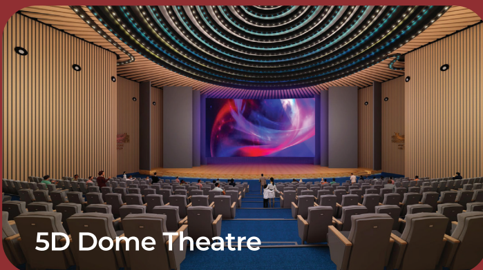
5D Dome Theatre