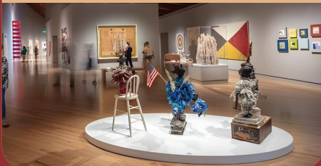
Special Exhibitions Gallery