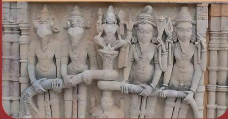
Orientation and Oceanic Oral Traditions