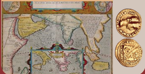
India's Contact with the Greco Roman World