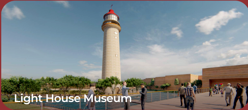
Light House Museum