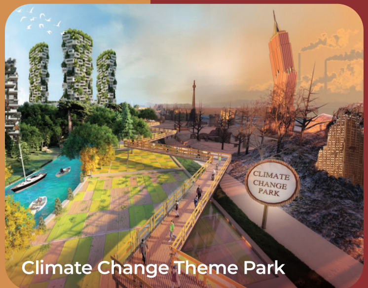
Climate Change Theme Park