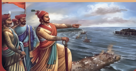
The Maratha Naval Power