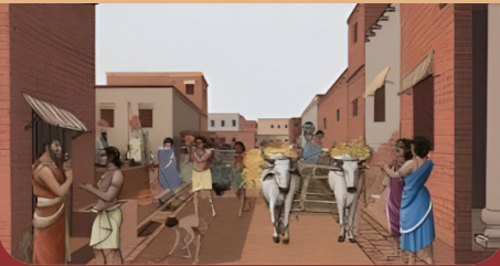
Harappan: The Pioneer Seafarers