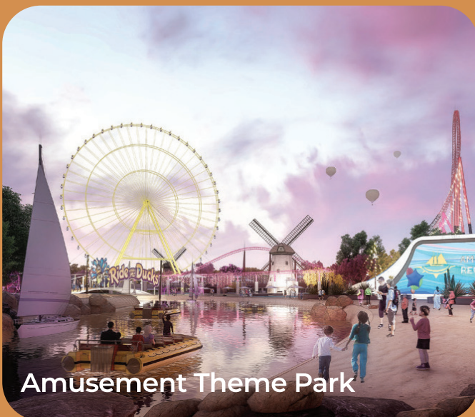
Amusement Theme Park